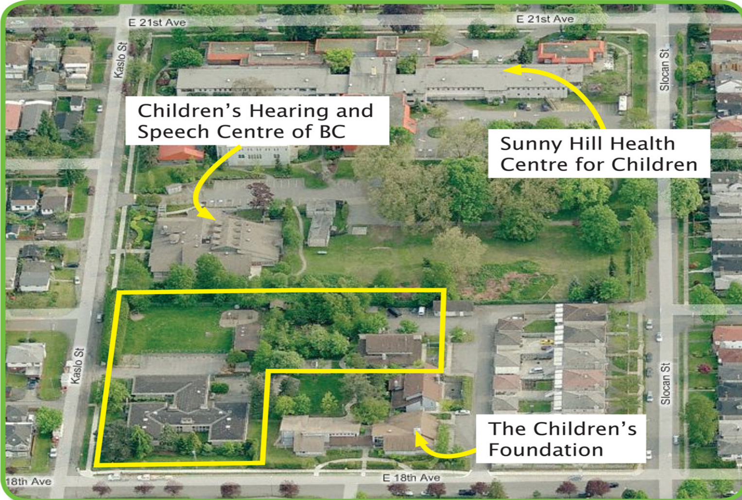
PAFC site looking south